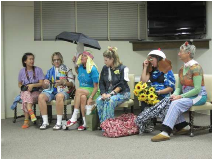
The Friday Night Style Show and our lovely contestants

If your picture is not here, please send money or else I will publish your picture, too! ☺